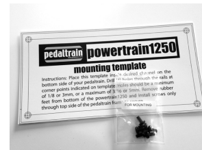
Mounting Template and Mounting Screws