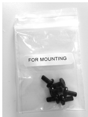
Mounting Screws Close-up