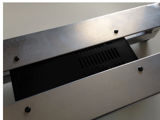
Mounting Screws Passing Through Pedaltrain